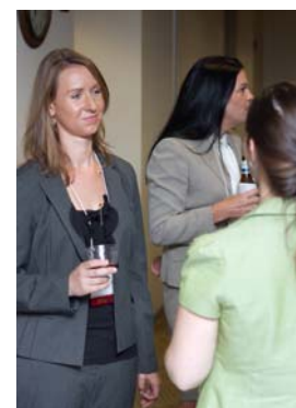
Richmond Networking Social Event, 2012

I can still recall the butterflies I felt in my stomach the first time I attended a Virginia Women in Public Finance event. As a North Carolina-based investment banker working my way up through the ranks, I initially became involved in the Virginia marketplace to assist the senior banker on my team who led our firm's efforts in the region. As is typical in my industry, that work began as mostly running numbers behind the scenes, but over time I was expected to spend more time outside of the office, interfacing with prospective clients and figuring out the competitive landscape of the market. Attending that VWPF event was one of my first efforts to do so and I still remember walking into the room and not knowing a soul. The first person to speak to me was another investment banker who probably saw how lost I looked. Despite my being a competitor, she very kindly introduced me to some other folks in the room. By the time I left a few hours later, I had a handful of business cards and felt a buzz of energy from connecting with other women in the market.